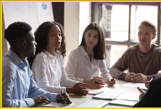
Teacher to Student Ratio: 1:13