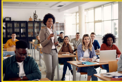
4 Day School Week