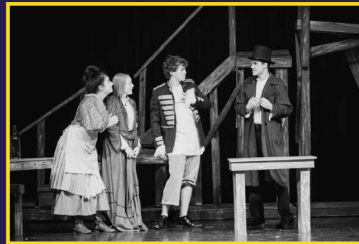
Fine Arts Track