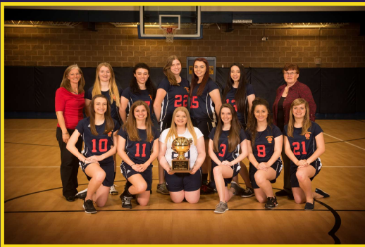
A Boarding School that Cares