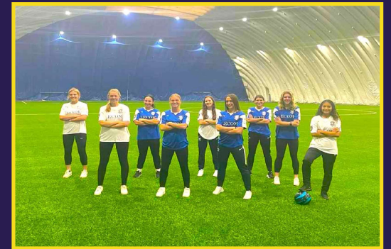
State of the Art Facilities